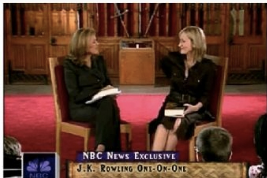
Meredith Vieira and J.K. Rowling.